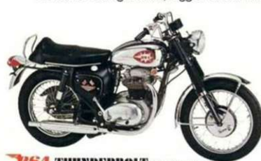
BSA THUNDERBOLT 650cc (40 cu. in.) Twin Big engine, small rev-count per mile, smoothest cruising performance and flashing new chrome fenders. The Thunderbolt is the one with the tamed thunder.