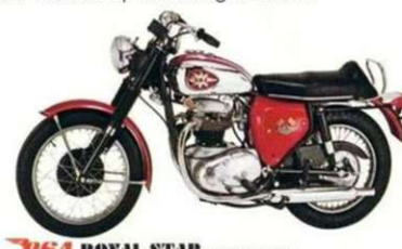
BSA ROYAL STAR 1000cc (60.8 cu. in.) Twin All the power you'll ever need to flatten the steepest hills, even with two up. Easy starting, easy riding, easy to look at and the lowest priced, full sized Twin in the line.